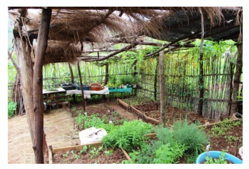
The garden of a participant