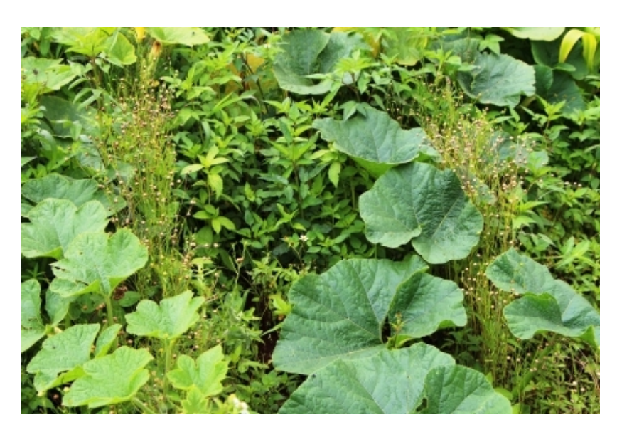
Ecologically and economically worthwhile: Intercropping