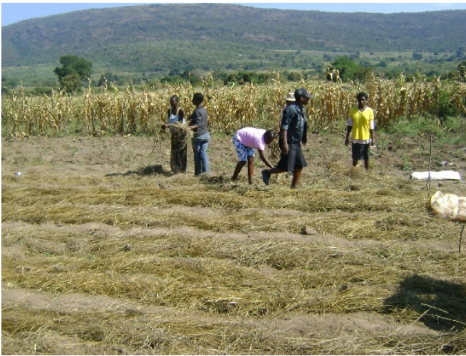
Youth group on the field