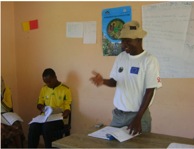
Course: what's all about about Organic Farming?